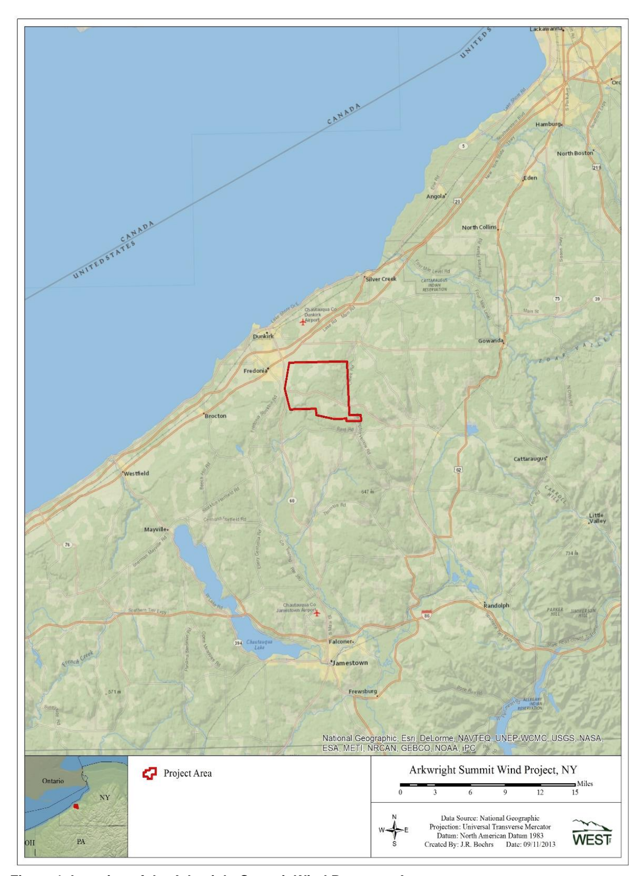
Figure 1. Location of the Arkwright Summit Wind Resource Area.